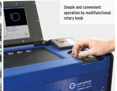
Simple and convenient operation by multifunctional rotary knob