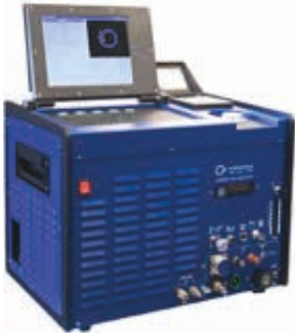
ORBIMAT 300 CA AVC/OSC