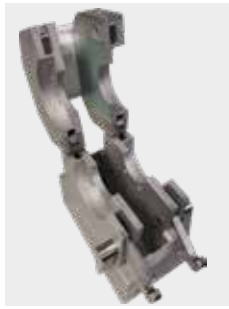
Practical tension locks for convenient one-handed operation