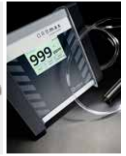
Wide accessories program, e.g. ORBmax residual oxygen meter