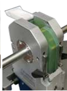
Flip up weld head cover "Flip Cover"