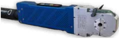
ORBIWELD 19 HD