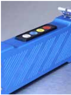
Robust and stable aluminum handle with integrated control panel