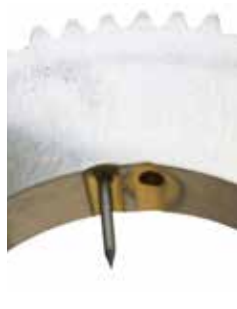
Easier insertion of the electrodes due to markings for \emptyset 1.0/1.6 mm (0.039"/0.063")