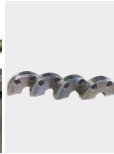
Diameter-specific clamping inserts (each 4-part, wide and narrow) available separately