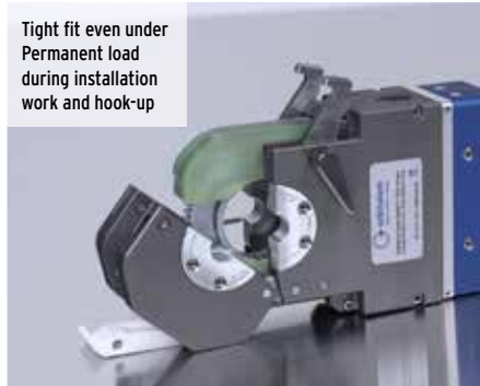
Tight fit even under Permanent load during installation work and hook-up

Precise, robust and powerful - that's the OW 19 HD micro weld head. As a continuation of the proven OW 19 orbital weld head, the HD version has a high load capacity. The use of a robust clamping mechanism guarantees a long service life with consistently precise weld seam quality. The OW 19 HD is particularly suitable for the installation and hook-up of pipes in the semiconductor industry. Conversion between OW 19 and OW 19 HD is possible at any time.