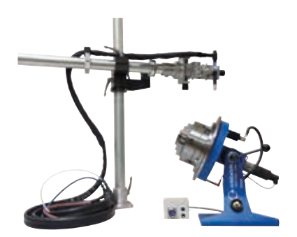
Welding turntable DVR 50