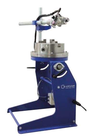
Welding turntable DVR 100