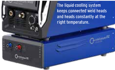
Mobile Welder OC PLUS

The liquid cooling system keeps connected weld heads and heads constantly at the right temperature.