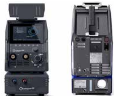
Mobile Welder OC PLUS Front and rear view

one power source for all challenges in modern tube installation.