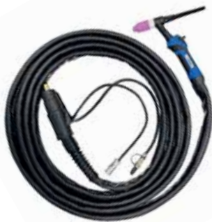
Gas-cooled TIG manual torch with 6 m hose package (optional)