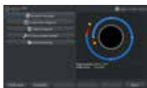
Interface Orbital welding