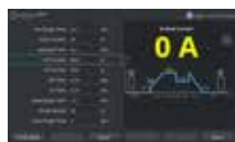
Interface Manual welding