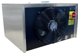
ORBICOOL Active (rear view)