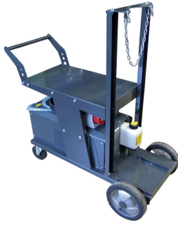
ORBICAR W trolley with integrated liquid cooling