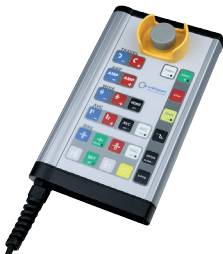
Remote control with cable