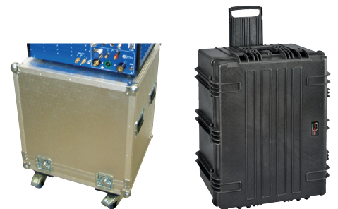
Storage and shipping case 165/300