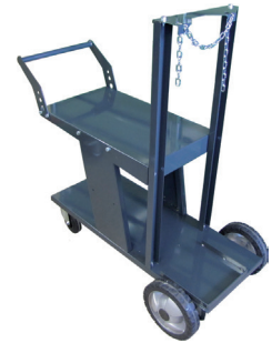
ORBICAR S trolley

Not suitable for use in combination with the compressor cooling device ORBICOOL Active.