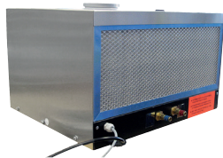
ORBICOOL Active (front view)

The device includes 2 cans, each with 3.5 liters (0.92 gal) of the OCL-30 coolant (see page 17). Suitable for all* ORBIMAT orbital welding power supplies). Not suitable for use in combination with the ORBICAR S trolley.