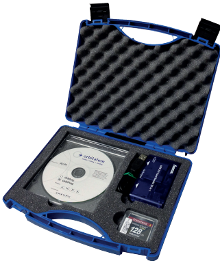
Soft-/Hardware package "CA"