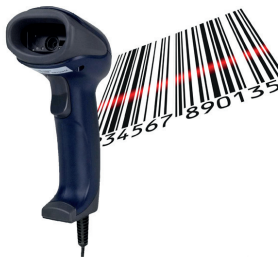
Bar code/QR code scanner SW